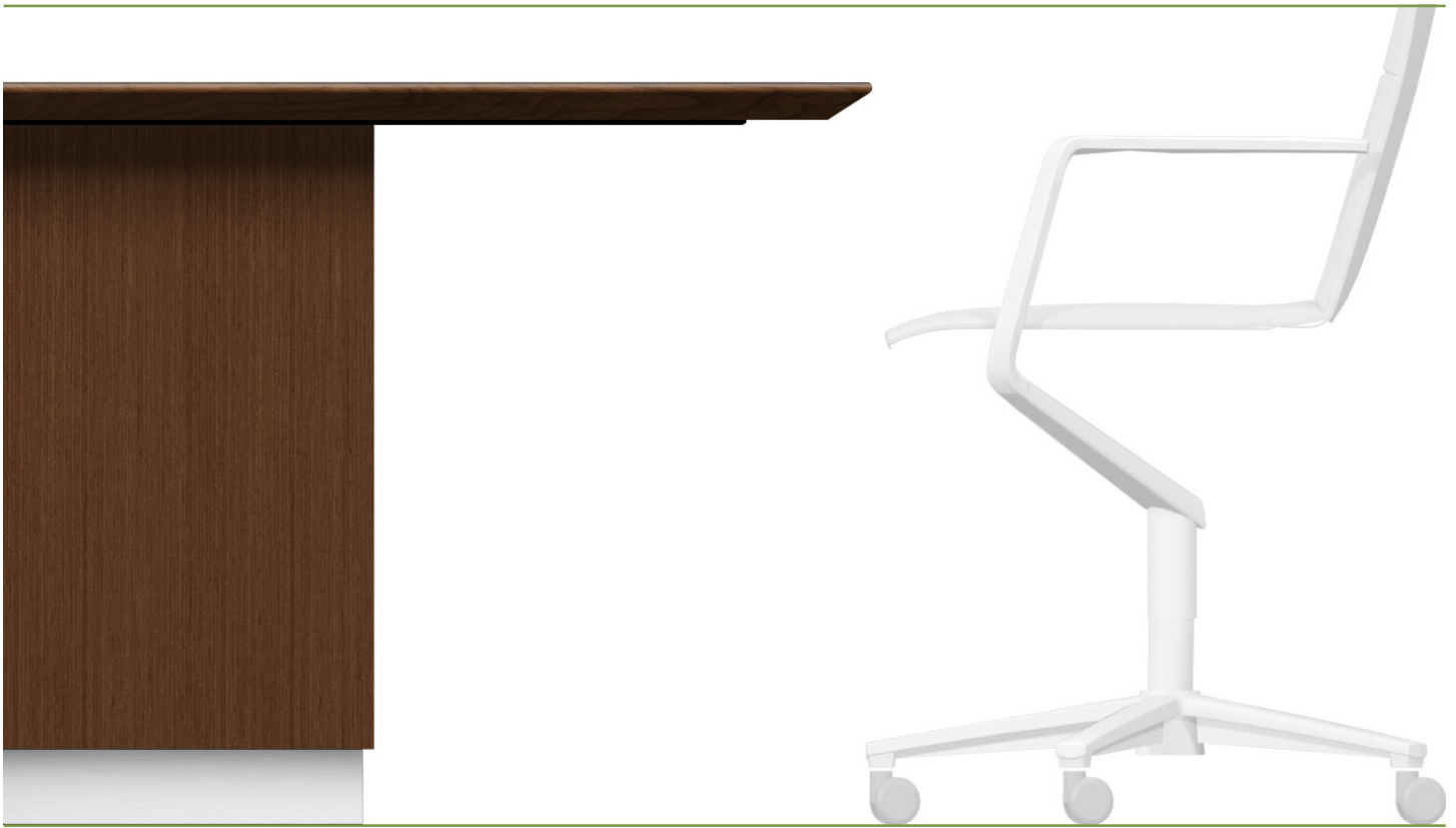
Shown in solid walnut, plain sliced walnut veneer and brushed stainless steel Available in a variety of materials to meet your custom design needs • A comfortable 20 inches of leg room between the table edge and base