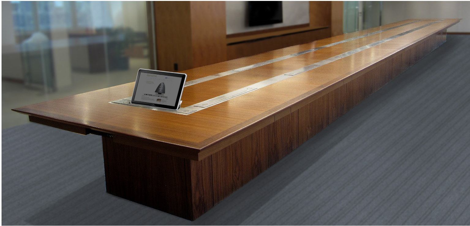
apron power with retractable lid